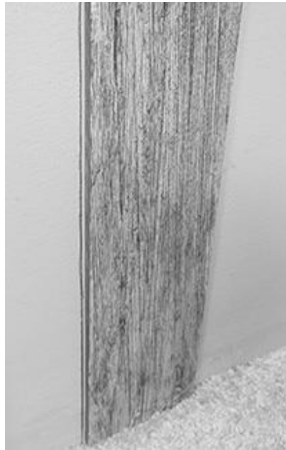
First row – vertical layout

Start by finding the center of the wall and mark its location on the floor. Using a level to make it plumb, install the first plank on the wall centered on the mark with construction adhesive and nail in place with a brad gun (see instructions above). Use a level to make sure it is plumb. Next, attach planks on the left and right of first centered plank until you reach the corners of both walls. The width of the final plank at each corner will need to be trimmed to fit.