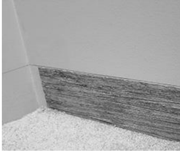
First row – horizontal layout

Starting on the floor, draw a level line at 6" from the floor. Next, attach the first plank in the left corner and add construction adhesive to the back of the plank and nail in place (see above instructions). Repeat this process until you reach the right wall cutting the pieces as needed. Stagger the next row of planks over the joints and cut pieces to fit as needed until you reach the ceiling. Finally, add wood trim at the floor to finish your installation, if desired.